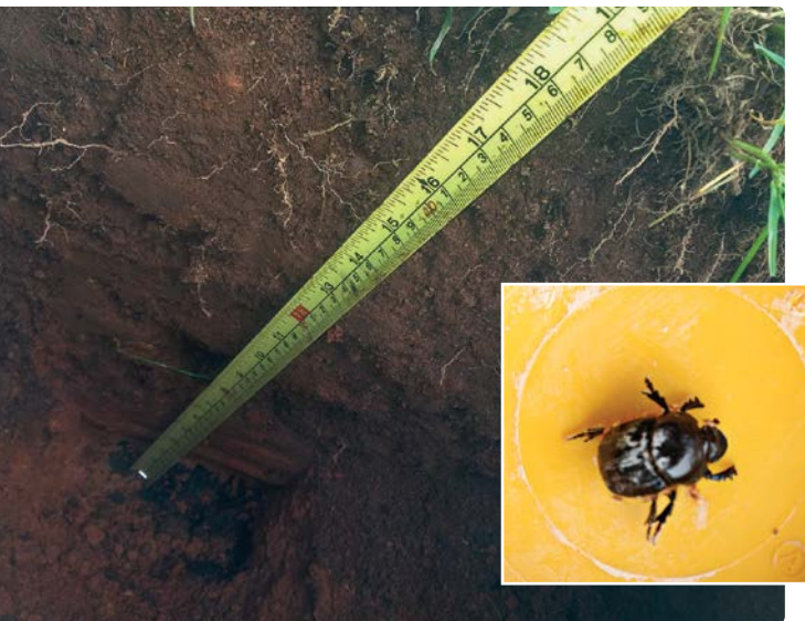
The dung beetles process the cow paddies quickly and bury it deep, usually 600 mm underground, along with biochar that was ingested by the cow. Pictured is the winter beetle, Bubas bison .

piggyback on the beetle and eat fly larvae in the dung. A beetle species Doug has brought in recently, Copris hispanus , is very widespread in Europe and is assured to thrive across southern Australia.