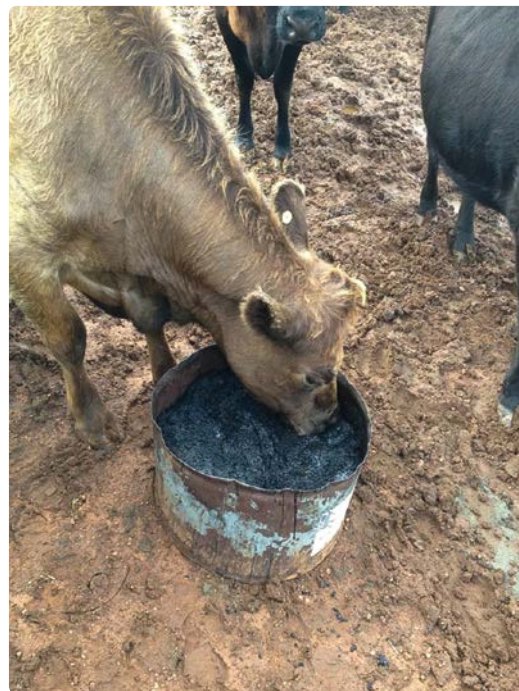
The biochar experiment started with the cows, feeding it purely as a test to see if, for almost no money, Doug could use two animals to sequester carbon into the ground. Not only does the cow and the beetle combination enhance the biochar but it's being dug very deep into the ground.

Soil health improvements from biochar include increased nutrient retention, reduced leaching, increased cation exchange capacity, improved soil structure and water-holding capacity, decreased soil acidity and increased numbers of