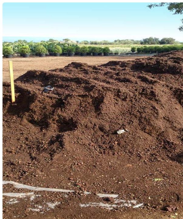
Avocados evolved in volcanic andosols, like this one on the slopes of Mount Etna, Italy. Doug said the soil looks similar to WA’s pea gravel, however the particles float on water.

‘We are trying to chemically get the soil similar to that which they evolved in, and biochar assists that.’